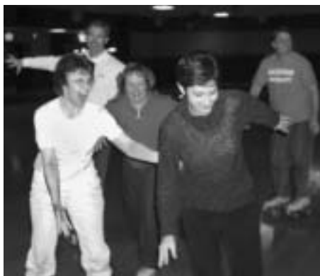
FSB faculty chicken dancing