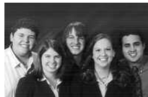
FSB student interns for CCS