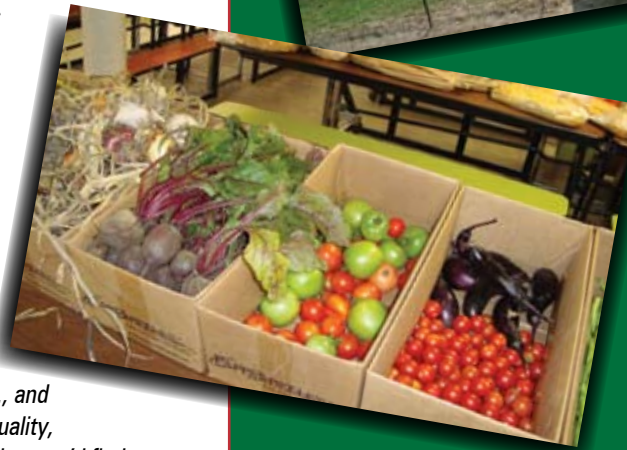
Delivery of produce to the Ingalls Food Pantry