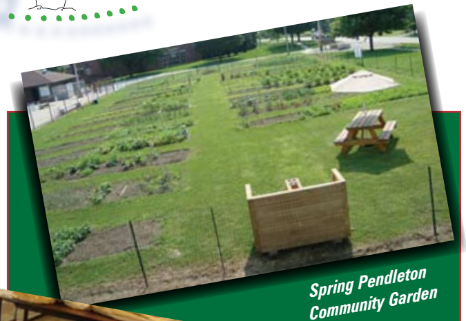
Spring Pendleton Community Garden