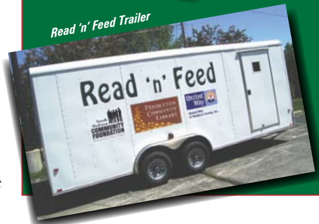
Read 'n' Feed Trailer