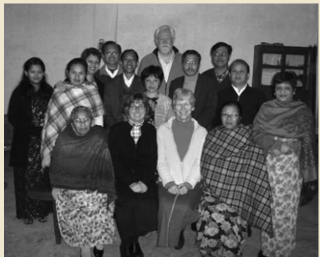
The study group and US guests