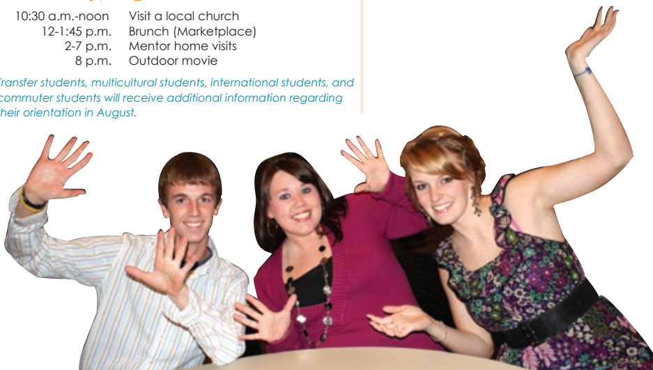
Mentor groups make the transition to college smoother. You'll be in groups of 15-17 new students with a peer mentor and a faculty mentor. Volunteers will also be on hand to help you lug your stuff up to your room on move-in day!